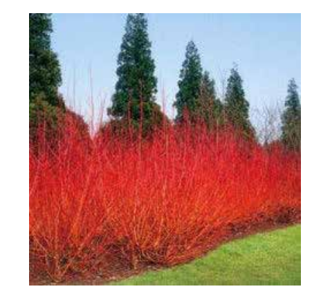
Red stemmed willow "Salix Britsensis" creating a natural frame