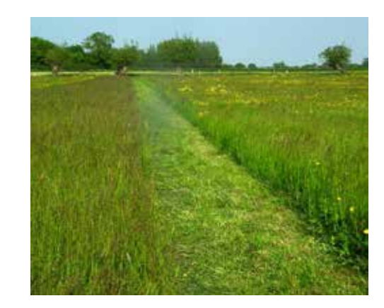
Mowed path_ meadows