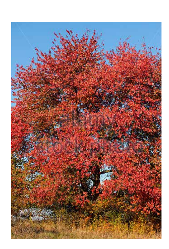
Flowerinf Cherries Prunus avium Plena "Bird Cherry".Prunus subhirtella Auminalis rosea "Winter Flowering Cherry"