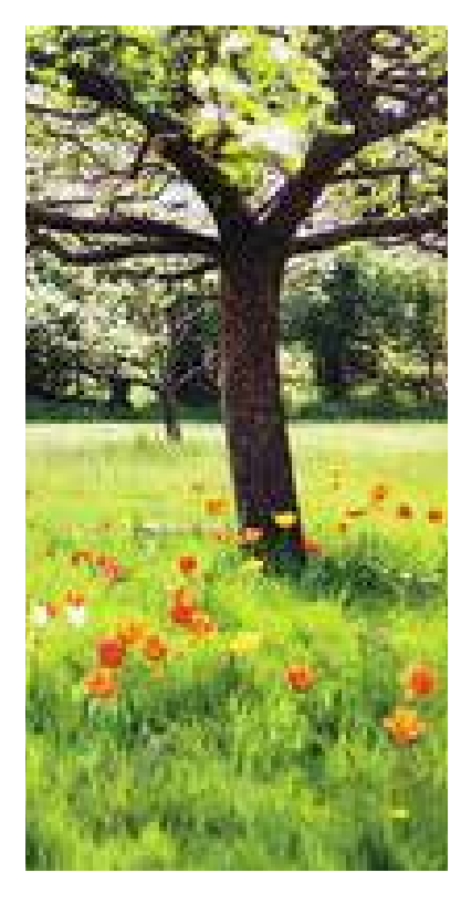
Blossom trees in meadow area and herbaceous gardens _