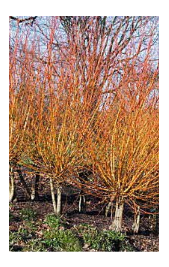
Golden stemmed Willow Salix alba Vitellina standards pollarded at 1.5-2m.