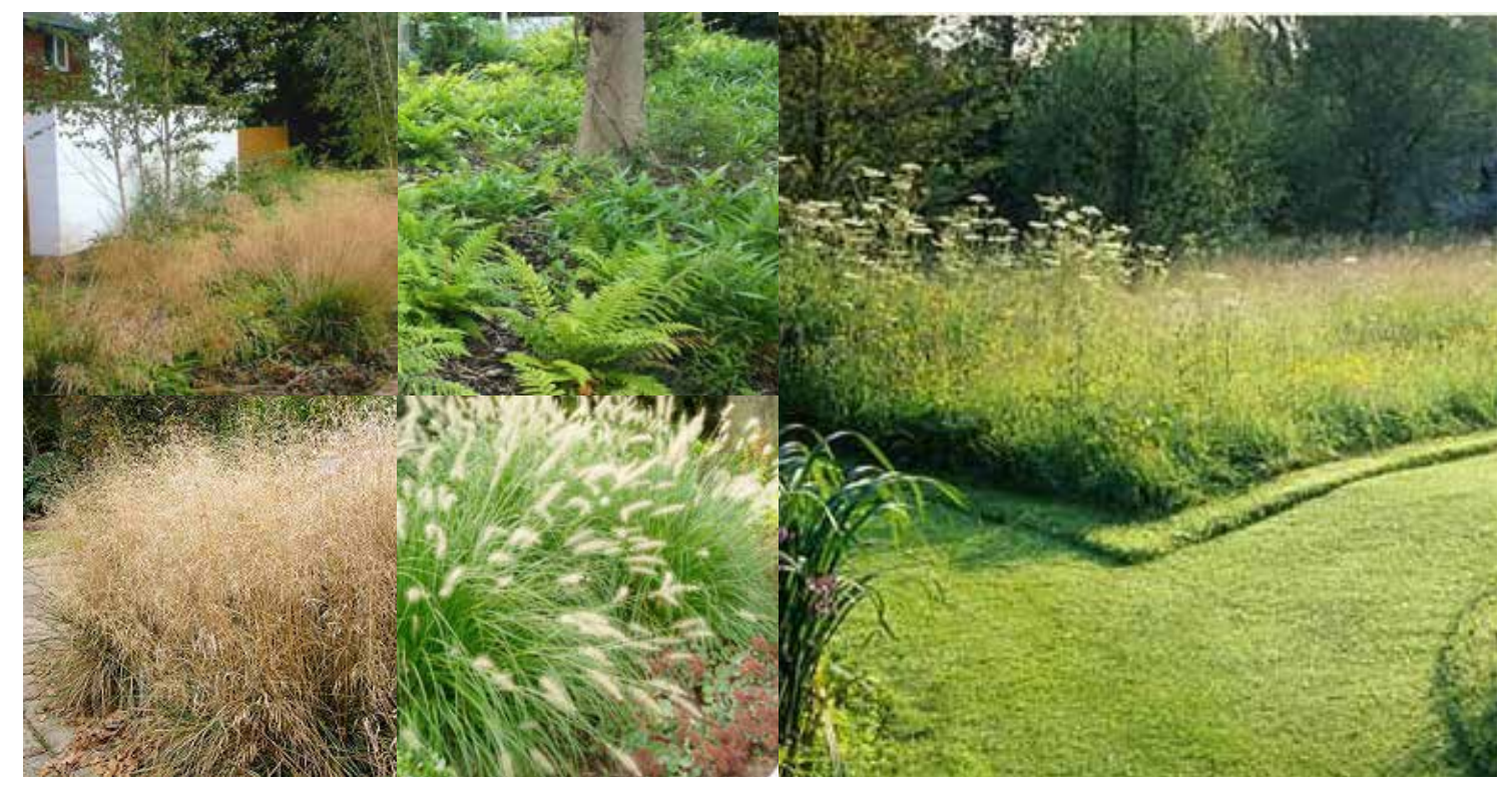
Frontage and side planting_ Multi stemmed Birch with shade tolerant grasses, sedge and ferns.