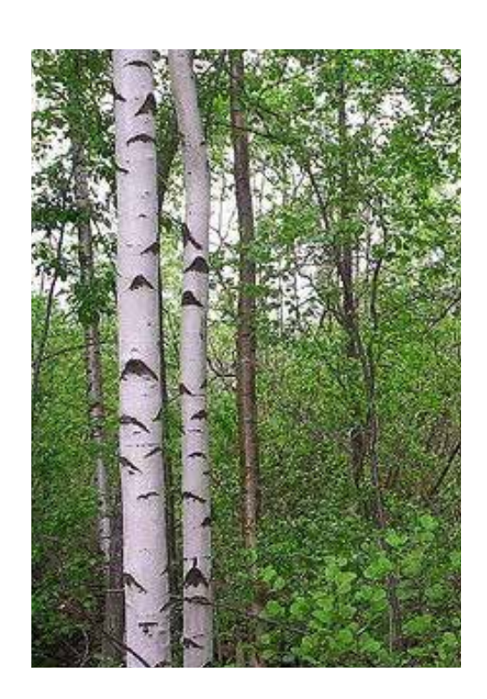
Frontage and side planting_ Multi stemmed Birch with shade tolerant grasses, sedge and ferns. Providing Winter bark effects and Autumn colour.