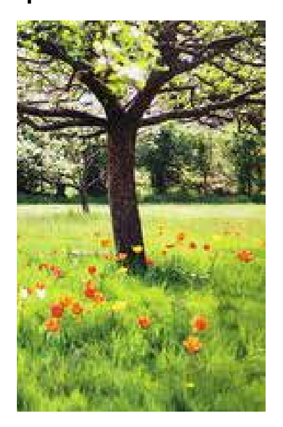
Blossom trees in meadow area and herbaceous gardens _